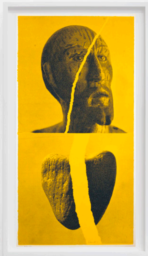
CORITA KENT sacred heart , 1969

Screenprint 23 1/8 x 12 1/8 in (58.7 x 30.8 cm) Edition size unknown (Inv# CK20-021.a)