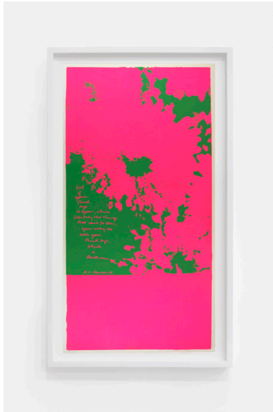
CORITA KENT third eye , 1969

Screenprint 22 1/2 x 11 1/2 in (57.2 x 29.2 cm) Edition size unknown (Inv# CK19-009.a)