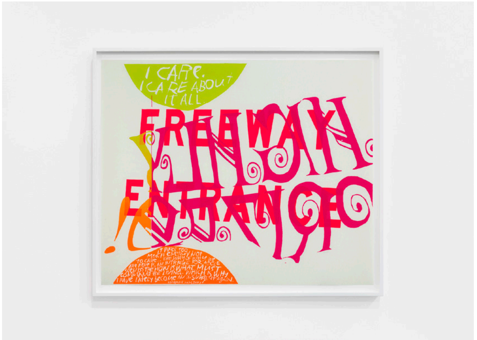
CORITA KENT highly prized, 1967

Screenprint 30 x 36 in (76.2 x 91.4 cm) Edition size unknown (Inv# CK20-024.a)