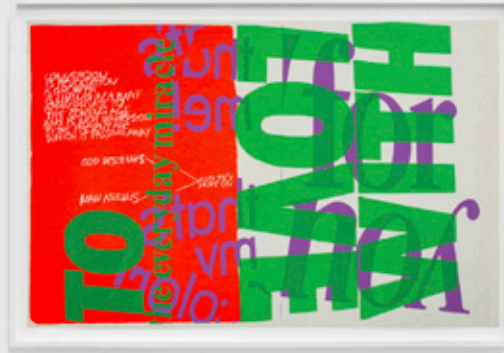
CORITA KENT with love to the everyday miracle, 1967

Screenprint 23 x 35 in (58.4 x 88.9 cm) Edition size unknown (Inv# CK20-020.a)