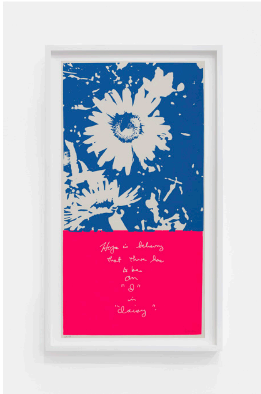
CORITA KENT i in daisy , 1969

Screenprint 23 x 12 in (58.4 x 30.5 cm) Edition size unknown (Inv# CK19-011.c)