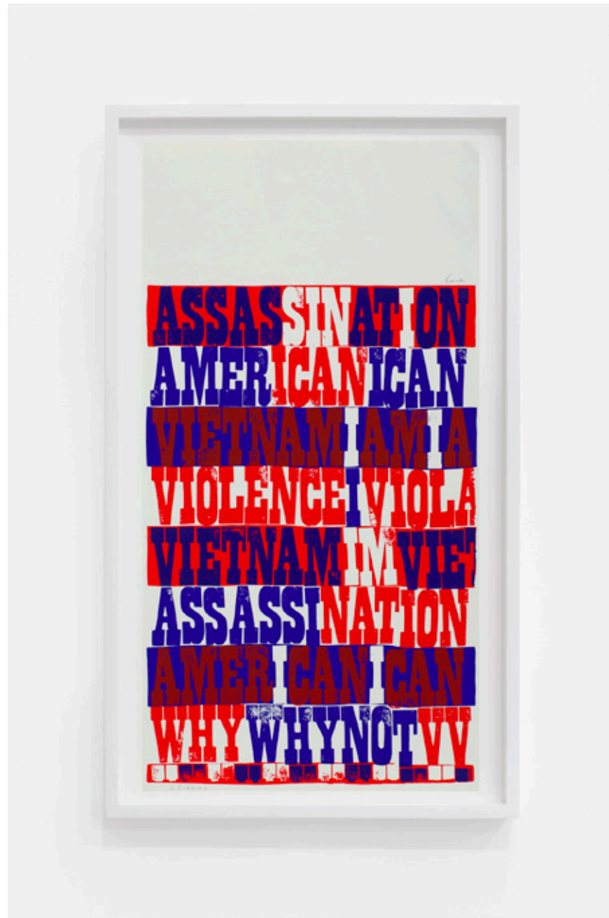
CORITA KENT American Sampler , 1969

Screenprint 22 1/2 x 11 1/2 in (57.2 x 29.2 cm) Edition size unknown (Inv# CK20-022)