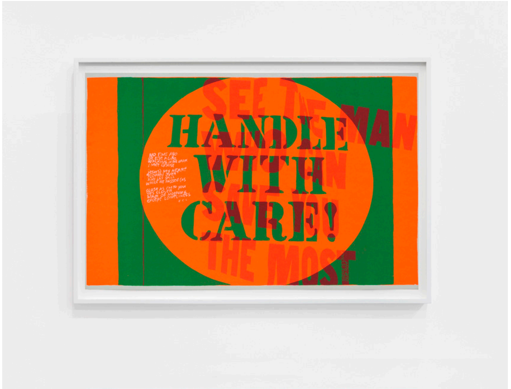
CORITA KENT handle with care , 1967

Screenprint 23 x 35 in (58.4 x 88.9 cm); framed: 26 x 38 x 1 1/2 in (66 x 96.5 x 3.8 cm) Edition of 200 (Inv# CK19-004.c)