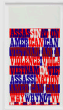
CORITA KENT American Sampler , 1969

Screenprint 22 1/2 x 11 1/2 in (57.2 x 29.2 cm) Edition size unknown (Inv# CK20-022)