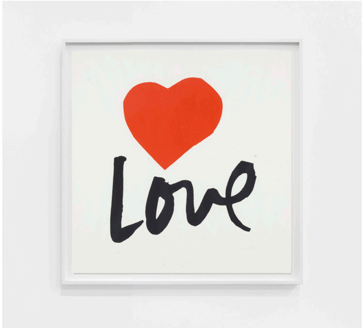
CORITA KENT yes #3, 1979

Screenprint 19 7/8 x 19 7/8 in (50.5 x 50.5 cm) Edition of 500 (Inv# CK19-034.a)