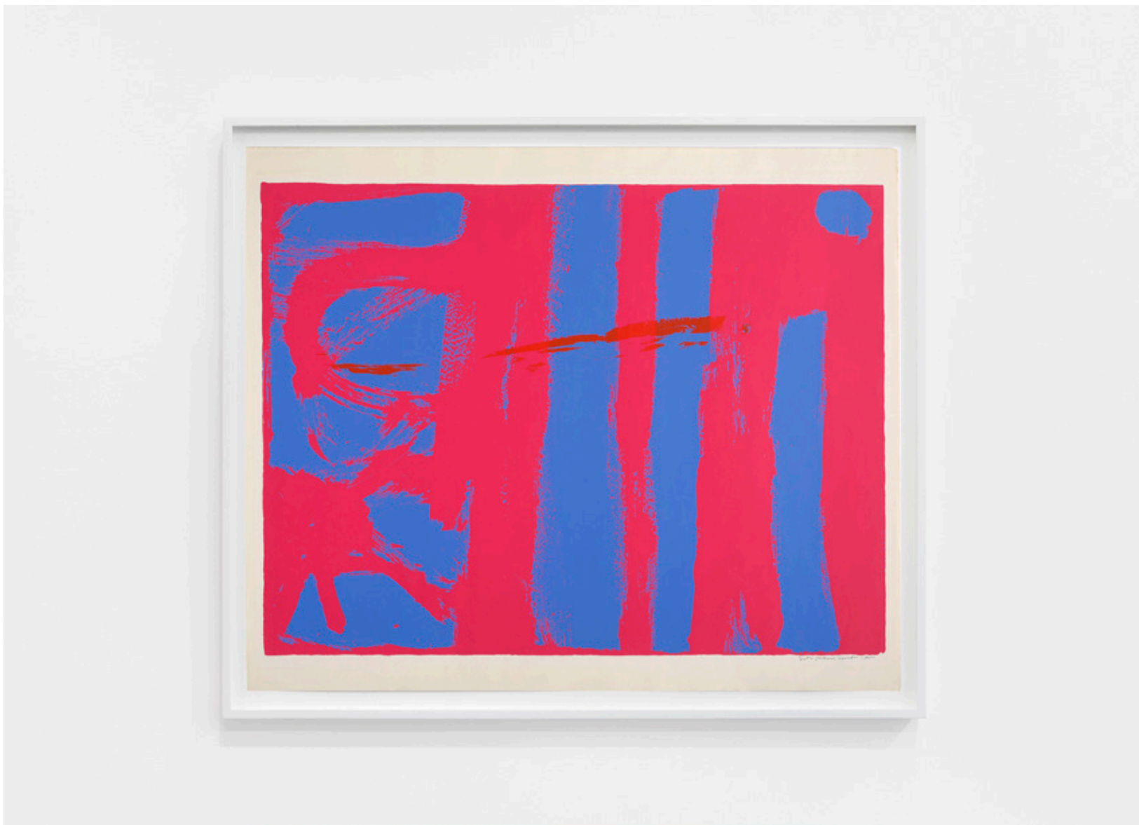
CORITA KENT hi , 1963

Screenprint 25 1/2 x 30 5/8 in (64.8 x 77.8 cm) Edition of 90 (Inv# CK19-001.b)