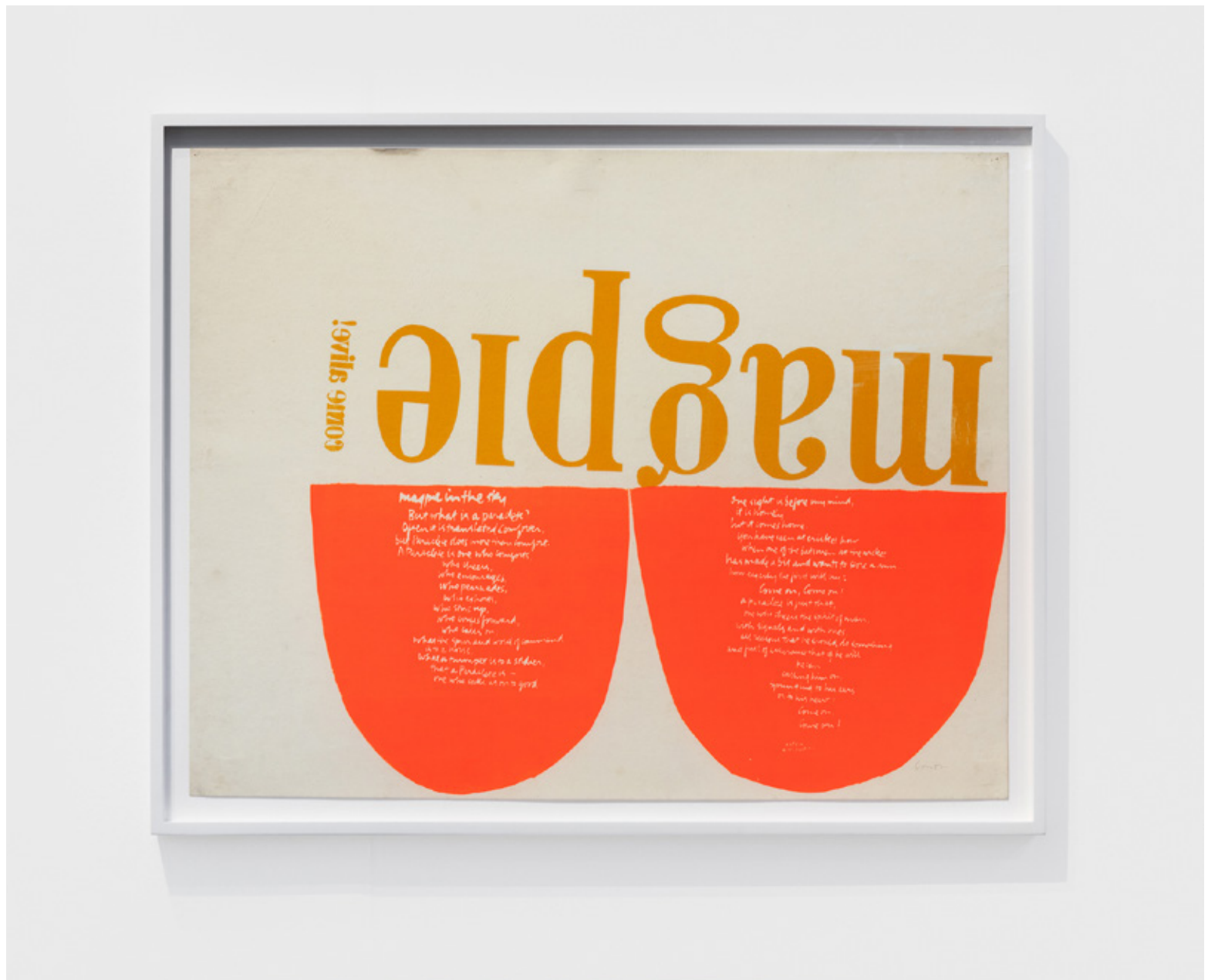
CORITA KENT magpie in the sky #1, 1965

Screenprint 26 3/4 x 34 in (67.9 x 86.3 cm); framed: 29 3/4 x 37 in (75.6 x 94 cm) Edition of 100 (Inv# CK19-027.a)