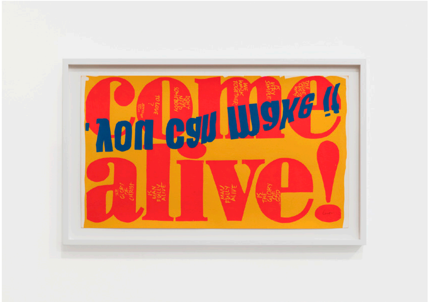
CORITA KENT come alive , 1967

Screenprint 13 x 23 in (33 x 58.4 cm); framed: 16 x 26 x 1 1/2 in (40.6 x 66 x 3.8 cm) Edition size unknown (Inv# CK19-006.c)