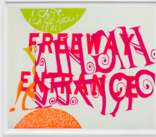
CORITA KENT highly prized, 1967

Screenprint 30 x 36 in (76.2 x 91.4 cm) Edition size unknown (Inv# CK20-024.a)