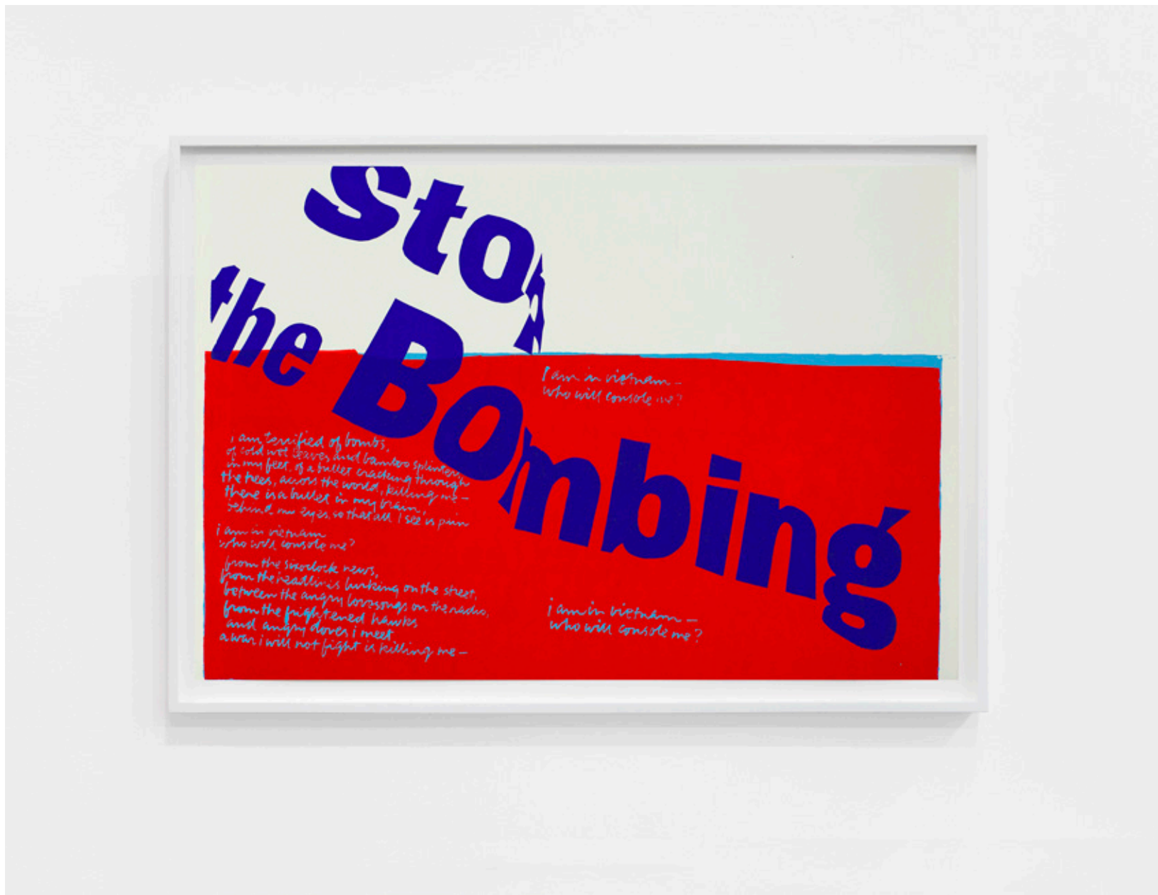
CORITA KENT stop the bombing , 1967

Screenprint 15 3/4 x 23 in (40 x 58.4 cm); framed: 18 3/4 x 26 in (47.6 x 66 cm) Edition size unknown (Inv# CK19-025.a)