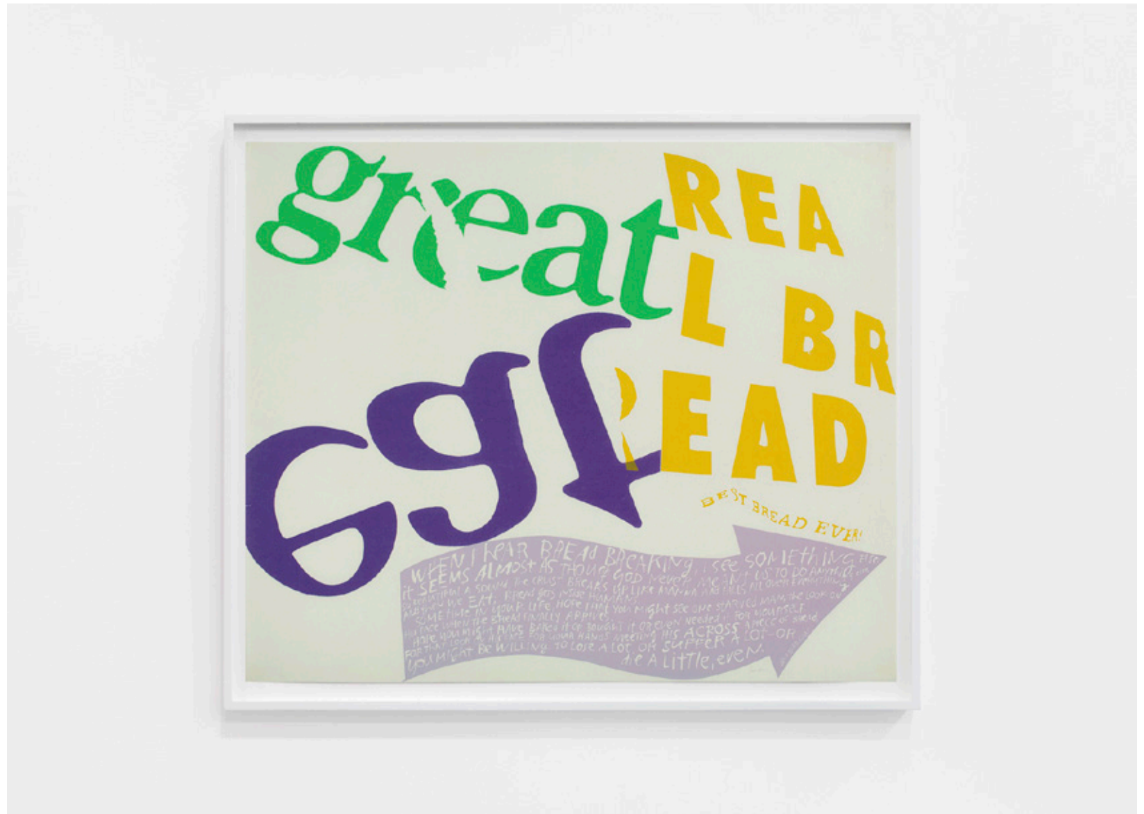
CORITA KENT greetings , 1967

Screenprint 30 x 36 in (76.2 x 91.4 cm) Edition size unknown (Inv# CK20-019.a)