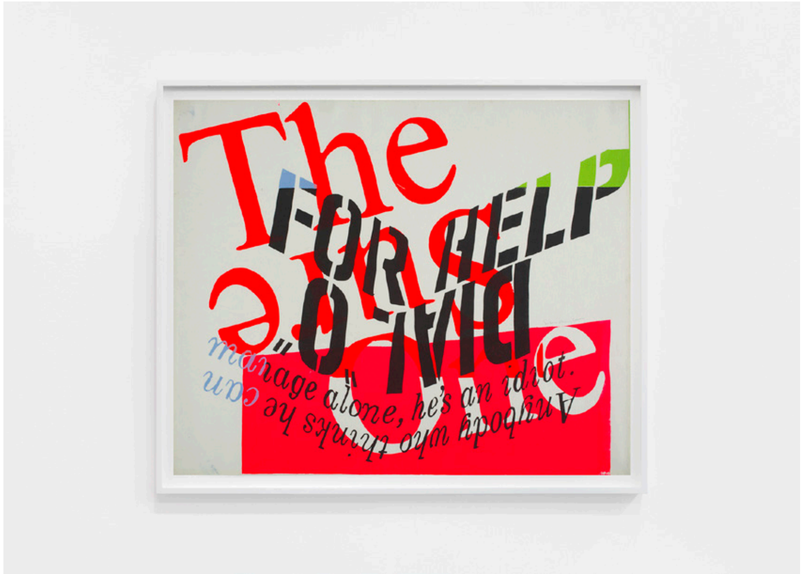
CORITA KENT the sure one , 1966

Screenprint 29 3/4 x 36 in (75.6 x 91.4 cm) Edition size unknown (Inv# CK20-018.a)