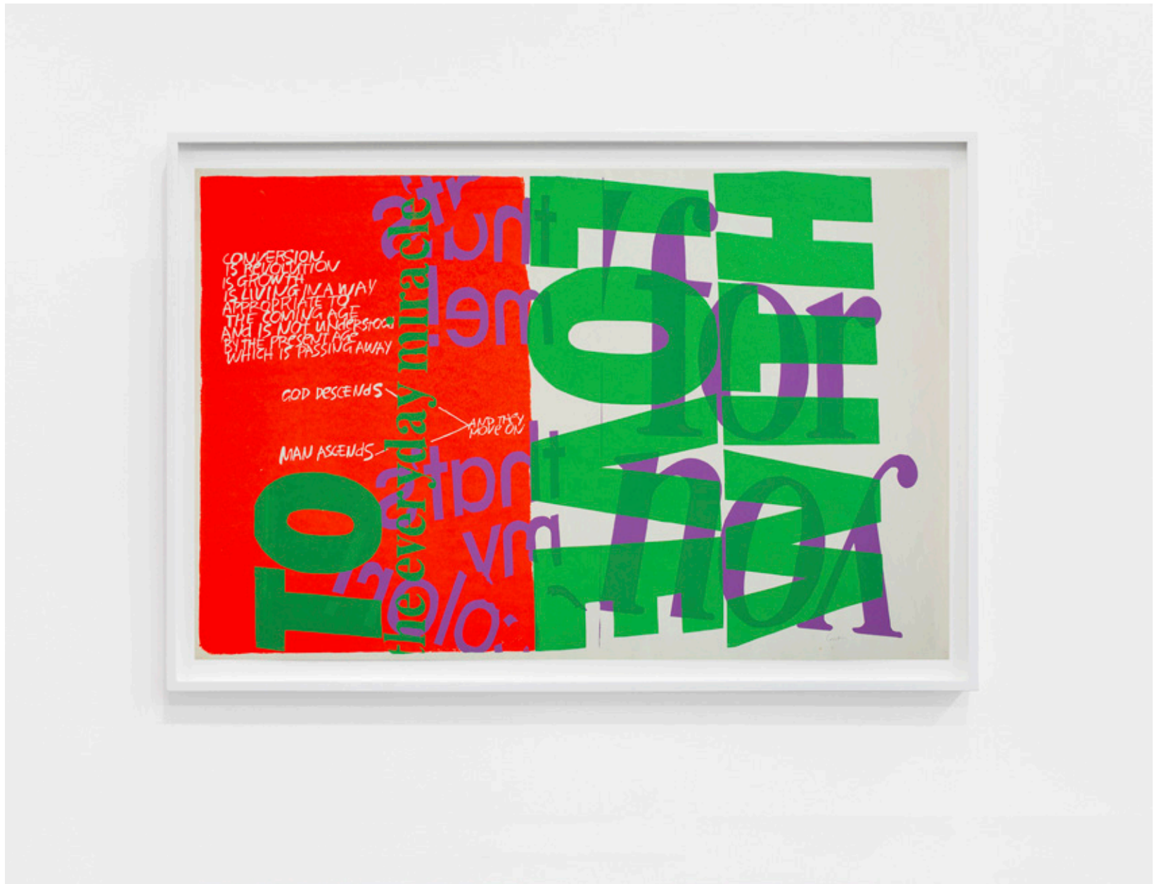
CORITA KENT with love to the everyday miracle, 1967

Screenprint 23 x 35 in (58.4 x 88.9 cm) Edition size unknown (Inv# CK20-020.a)