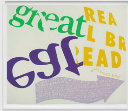
CORITA KENT greetings , 1967

Screenprint 30 x 36 in (76.2 x 91.4 cm) Edition size unknown (Inv# CK20-019.a)